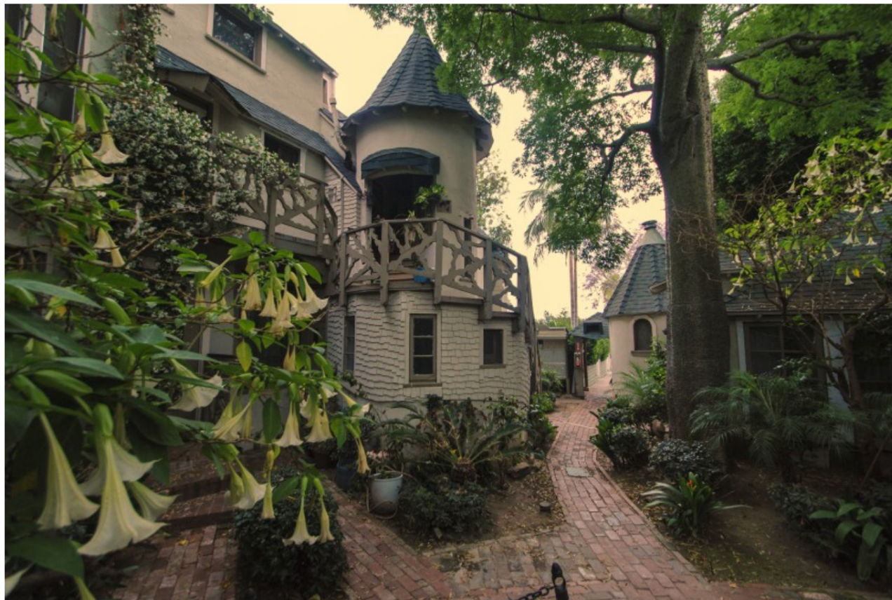
A look at Normandie Towers in West Hollywood. The apartments have been featured in the Witchy Architecture Tours.

A team of architectural preservationists has come up with a free, family-friendly driving tour of L.A. “witches’ houses,” including castles, cottages and other structures fit for a fairytale or ghost story. The list will be posted as a free download Oct. 13 by Friends of Residential Treasures: LA (FORT: LA), and this year’s itinerary covers five structures chosen by actor Amber Benson (who co-starred in the series “Buffy the Vampire Slayer”) including buildings in Hollywood, Los Feliz and West Hollywood. The group has also recorded actors reading bits of “Grimms’ Fairy Tale” passages, so you can listen while you drive. fortla.org